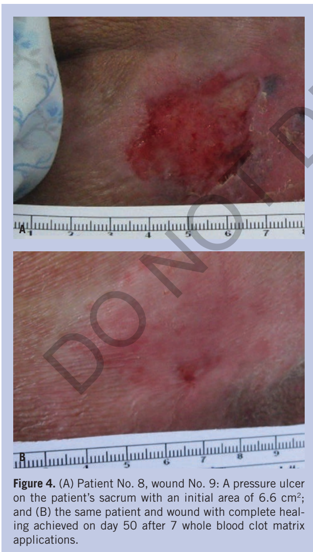
Figure 4. (A) Patient No. 8, wound No. 9: A pressure ulcer on the patient's sacrum with an initial area of 6.6 cm 2 ; and (B) the same patient and wound with complete healing achieved on day 50 after 7 whole blood clot matrix applications.

The average quantity of blood withdrawn per treatment session was 13.1 mL. Blood was withdrawn from all patients without interruption, and there were no excessive venipuncture attempts that could have resulted in large amounts of blood withdrawal. During the 35 whole blood clot matrix application sessions, only 1 vein puncture was needed for each of the blood withdrawal