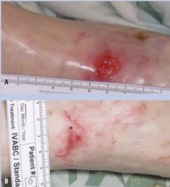
Figure 7. (A) Patient No. 1, wound No. 3: A venous ulcer on the patient's left foot with an initial area of 1.4 cm 2 ; and (B) the same patient and wound with complete healing achieved on day 11 after 1 whole blood clot matrix application.