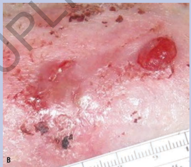
Figure 6. (A) Patient No. 1, wound No. 2: A venous ulcer on the patient's right foot with an exuding fistula beside the ulcer and an initial area of 3.1 cm 2 ; and (B) the same patient and wound with complete healing achieved on day 61 after 7 whole blood clot matrix applications. The fistula remained unhealed and the final wound area was 0.7 cm 2 (77% closure).

old female patient presented with 2 venous ulcers of 3 months duration each, 1 on the dorsal side of the right foot (wound No. 2; Figure 6A) and another on the dorsal side of the left foot (wound No. 3; Figure 7A). The patient was also diagnosed with a 1 cm long, exuding fistula next to wound No. 2 (Figure 6A), which was also treated with the product. The patient was bedridden with serious comorbidities, including paralysis on the right side of her body following a stroke, hypertension, malnutrition, severe dementia, hypoalbuminemia, and chronic anemia. The ulcer on the right foot was more than twice the area of the ulcer on the left foot (3.1 cm 2 and 1.4 cm 2 , respectively). The smaller ulcer healed after 11 days with a single application of the whole blood clot matrix (Figure 7B). The fistula required a surgical procedure and was then