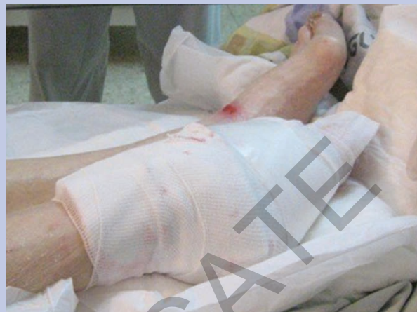
Figure 3. After the clot matrix was affixed to the wound, primary and secondary dressings were applied.

to be created. Next, the nurse opened the clotting tray using sterile gloves and gently lifted the whole blood clot matrix (Figure 2A). The clot was placed on the wound, with the embedded gauze pad facing upwards (Figure 2B) and anchored to the wound via the gauze edges. Primary and secondary dressings further affixed the clot to the wound (Figure 3).