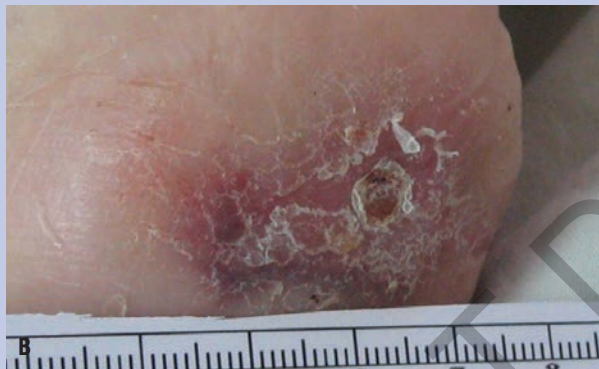
Figure 5. (A) Patient No. 6, wound No. 6: A pressure ulcer on the patient's left heel with an initial area of 4.7 cm 2 ; and (B) the same patient and wound with complete healing achieved on day 49 after 7 whole blood clot matrix applications.