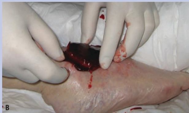
Figure 2. (A) After 10 minutes in the clotting tray, the whole blood clot matrix was formed from the coagulated blood; and (B) the nurse, using sterile gloves, removed the matrix from the tray and placed it over the wound.