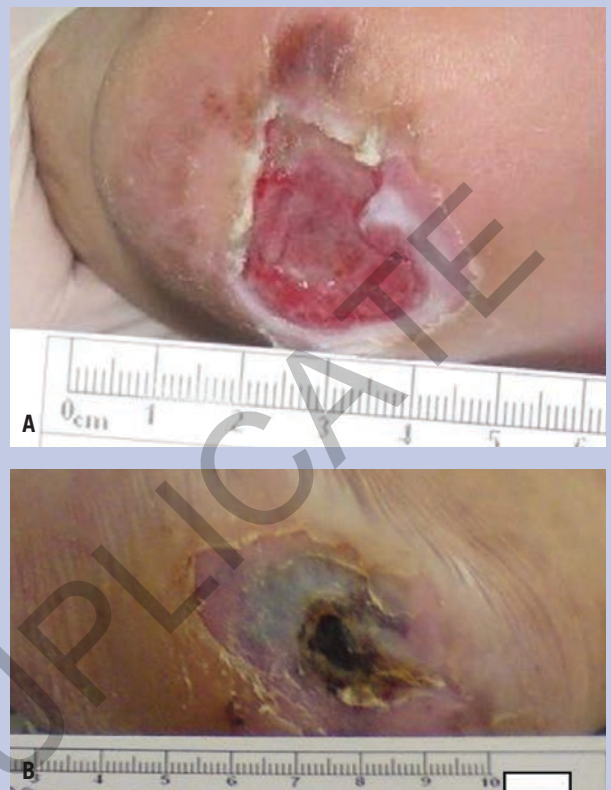
Figure 8. (A) Patient No. 4, wound No. 4: A pressure ulcer on the patient's right heel with an initial area of 3.6cm 2 before treatment with the whole blood clot matrix; and (B) the same patient and wound on day 36 with 82% closure (final area: 0.64 cm 2 ). Treatment was terminated after 5 applications of the whole blood clot matrix because the wound reopened following poor offloading that resulted in recurrent direct pressure on the wound.

mentia, and obesity. The initial wound area was 3.6 cm 2 (Figure 8A). Treatment was stopped after 82% closure was achieved with a final wound area of 0.6 cm 2 recorded on day 36, because the wound deteriorated and increased in size (Figure 8B) as a result of recurrent direct pressure exerted on the wound from a less than optimal offloading procedure. On day 40, an adverse event unrelated to the whole blood clot matrix occurred, when the nurse let the wound lay directly on the metal bed side, which caused mechanical trauma to the wound. The wound area increased to its size at enrollment.