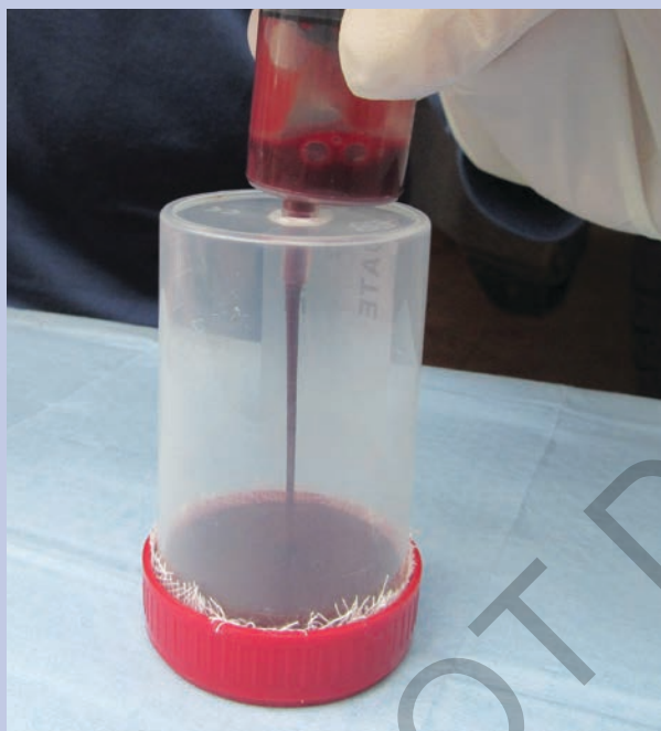
Figure 1. The selected clotting tray was placed on a flat, horizontal surface. After being mixed with the kaolin + calcium gluconate suspension, the coagulated blood was injected into the clotting tray.

application session; the provider had the clinical judgment to decide to stop venipuncture if necessary. Five mL of calcium gluconate was mixed in a sterile vial with 35 mg of sterile kaolin white powder. A specified amount (Table 1) of the mixture was extracted using the syringe which already contained the citrated blood. The suspension was gently mixed for 10 seconds. The coagulating blood was injected into the preselected clotting tray (Figure 1). The nurse then waited for 10 minutes for the clot