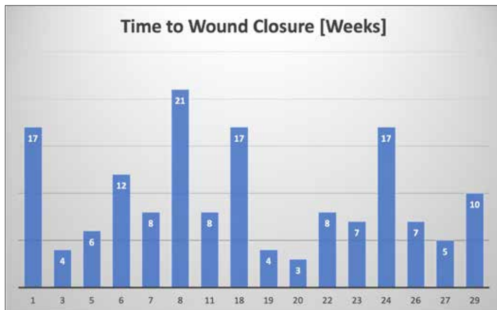
Figure 5. Time to wound closure (in weeks).

follow-up (LTFU) during the observation periods. The time between baseline and last observation varied among participants depending on the time taken for wound closure, as well as the cut off point for the observation study.